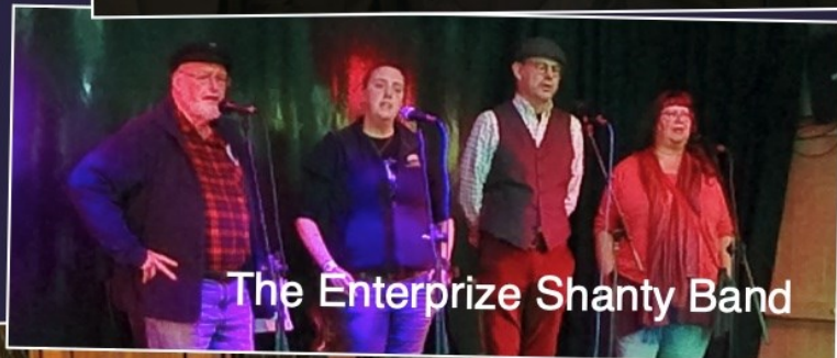
The Enterprize Shanty Band