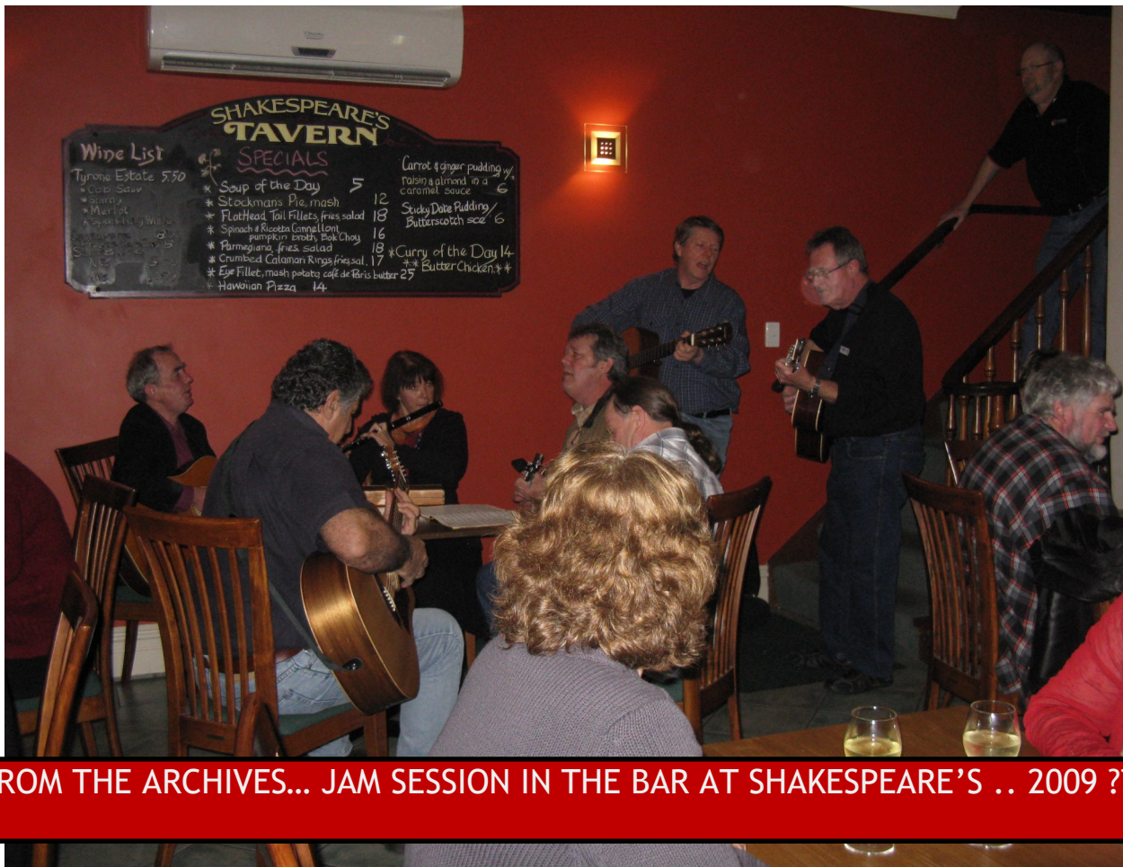
FROM THE ARCHIVES... JAM SESSION IN THE BAR AT SHAKESPEARE'S .. 2009 ??

OPEN MIC AT THE GREEN The night is still held the 3rd Thursday of every month at the Yamala Bowling Club, Dunstan St Frankston. Doors open at 6.30 pm at which time one of the acts will play through to 7.00 pm at which time the actual Open Mic starts.