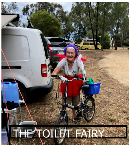
THE TOILET FAIRY