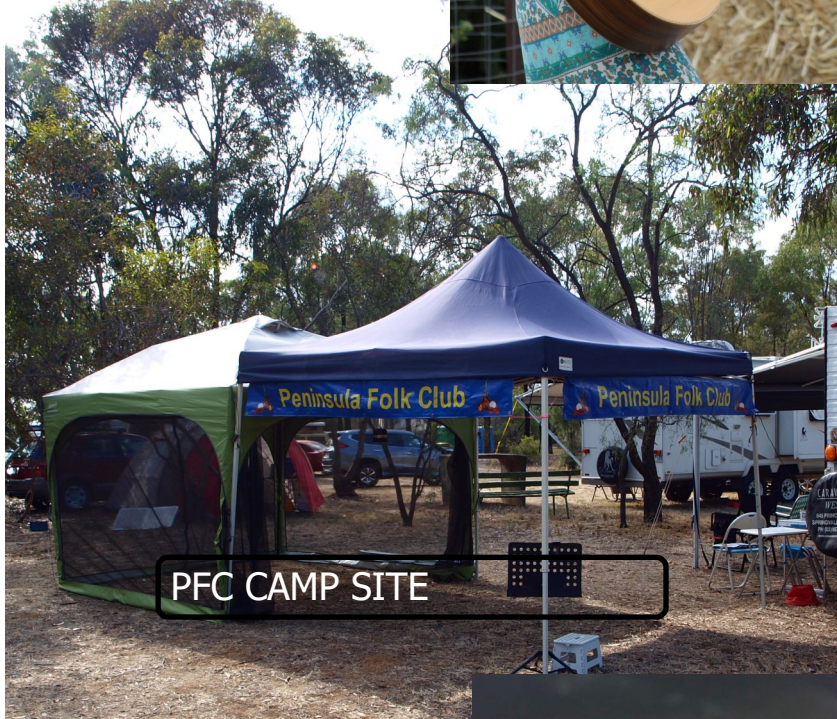
PFC CAMP SITE