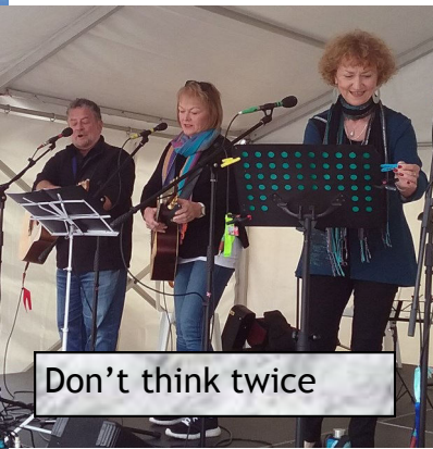
Don't think twice