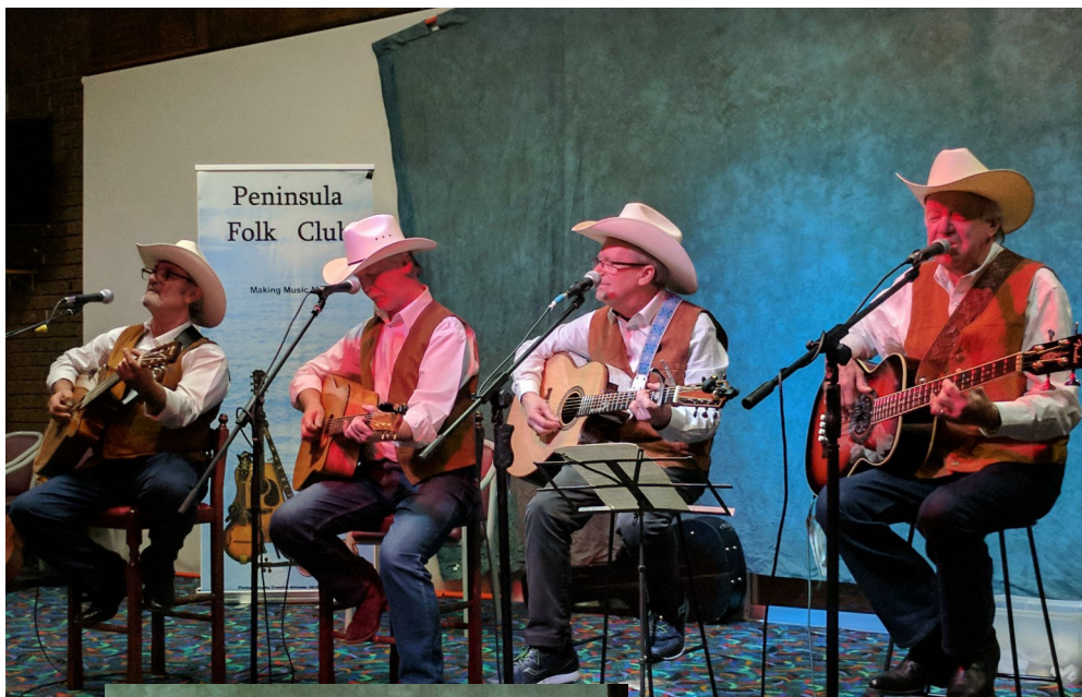
GRANDSONS OF THE PIONEERS