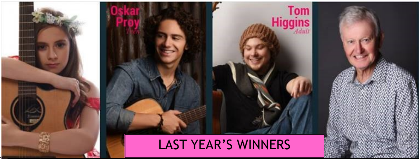
LAST YEAR'S WINNERS

Winners in each category gets a package inc a song written, a CD recording, a professional photo shoot, a film clip and opportunities to perform at local community venues including Festival of Lights