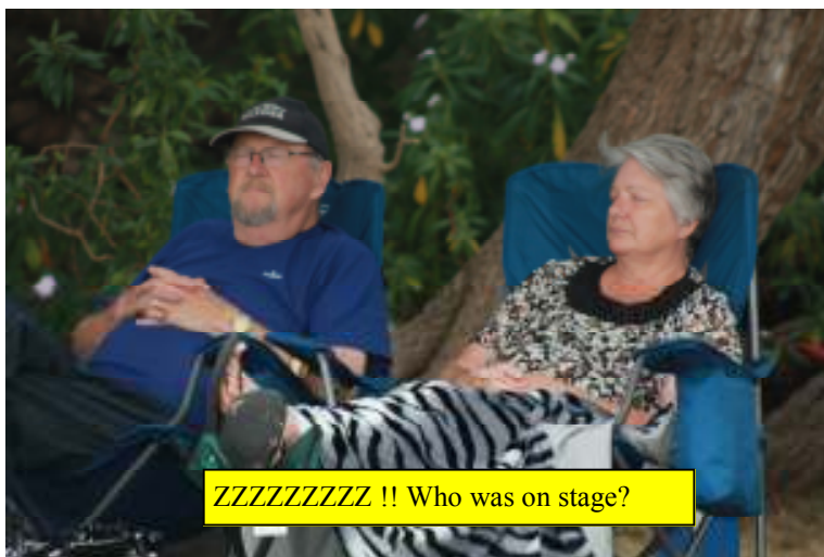
ZZZZZZZZ !! Who was on stage?