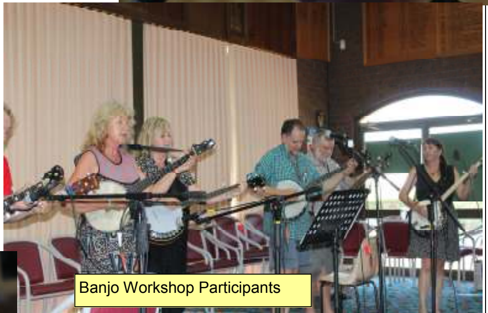
Banjo Workshop Participants