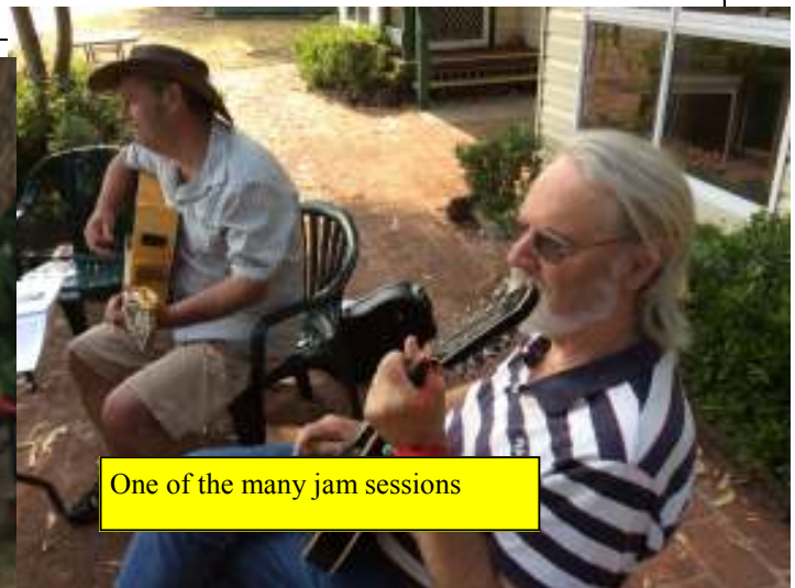
One of the many jam sessions

$327.75 RAISED FOR BLAZE AID AT THE NEW HAVEN CONCERT . WELL DONE PFC