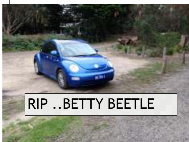
RIP ..BETTY BEETLE