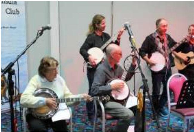
BANJO WORKSHOP PARTICIPANTS