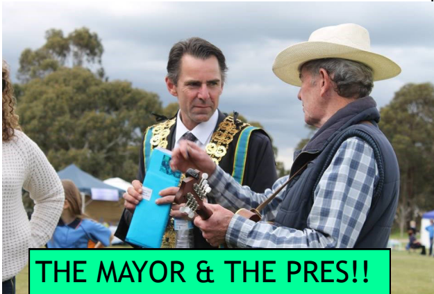
THE MAYOR & THE PRES!!

know who we are!! Come along and support the club and enjoy the festivities!!!