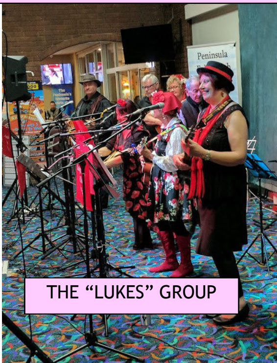
THE "LUKES" GROUP

Wait until they've been together for a while..Seriously good instrumentalists!!