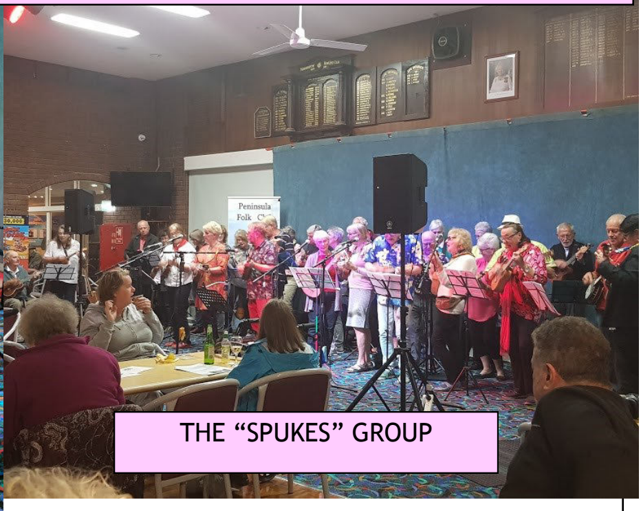
THE "SPUKES" GROUP