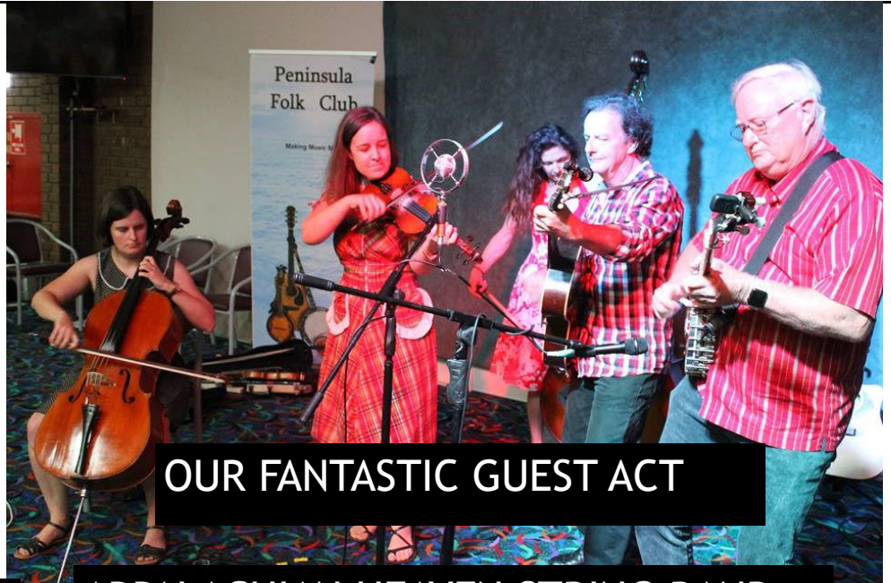
OUR FANTASTIC GUEST ACT