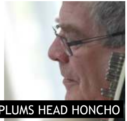
PLUMS HEAD HONCHO

Admission to the Open Mic session is $3 & includes Tea, Coffee, Biccies.