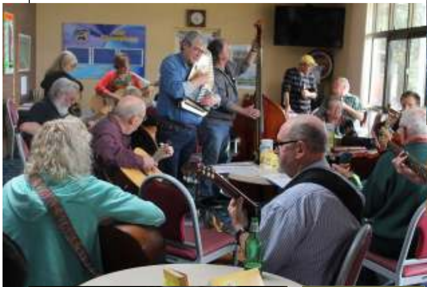
Above: Jam Session